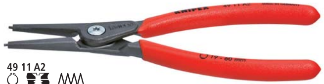
49 11 A2